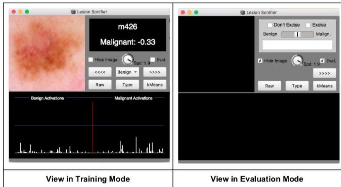
Figure 1: The GUI used for interactively exploring the dataset and sampling the three sonification designs. In the training mode, the sonification strategies are paired with an image of the skin region and AI-output. In the evaluation mode, the user makes decisions based upon the sonification alone.

with the “good” sounds, the cues used for “badness” increased in magnitude when lesions were classified as being more malignant, and decreased in magnitude when lesions were classified as being more benign.