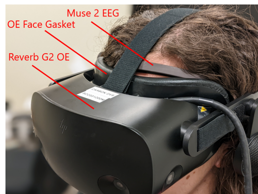
Figure 1: Interface hardware: Reverb G2 Omnicept Edition VR headset, Omnicept Edition face gasket, and Muse 2 EEG headband.

Many researchers have explored the tongue as an input paradigm using various devices and sensing modalities. Where early work on tongue interfaces depended on intrusive retainers placed in the mouth [9], later work has used electromyography (EMG) sensors around the mouth, jaw and cheeks [10]. Some interfaces have even succeeded in detecting motion remotely through external sensors by using the Doppler shift effect [5]. Their applications have also